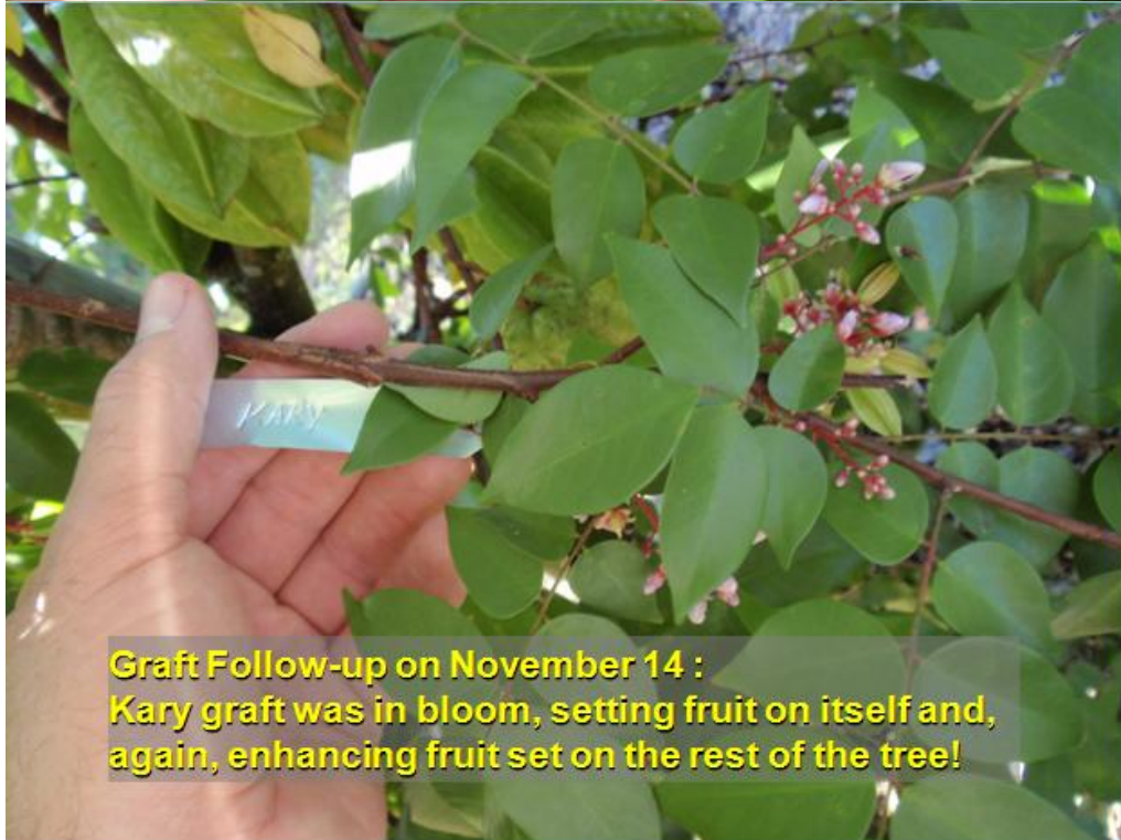
Graft Follow-up on November 14 : Kary graft was in bloom, setting fruit on itself and, again, enhancing fruit set on the rest of the tree!