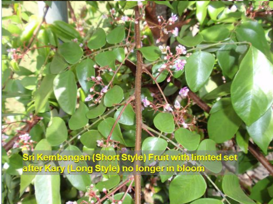
Sri Kembangan (Short Style) Fruit with limited set after Kary (Long Style) no longer in bloom