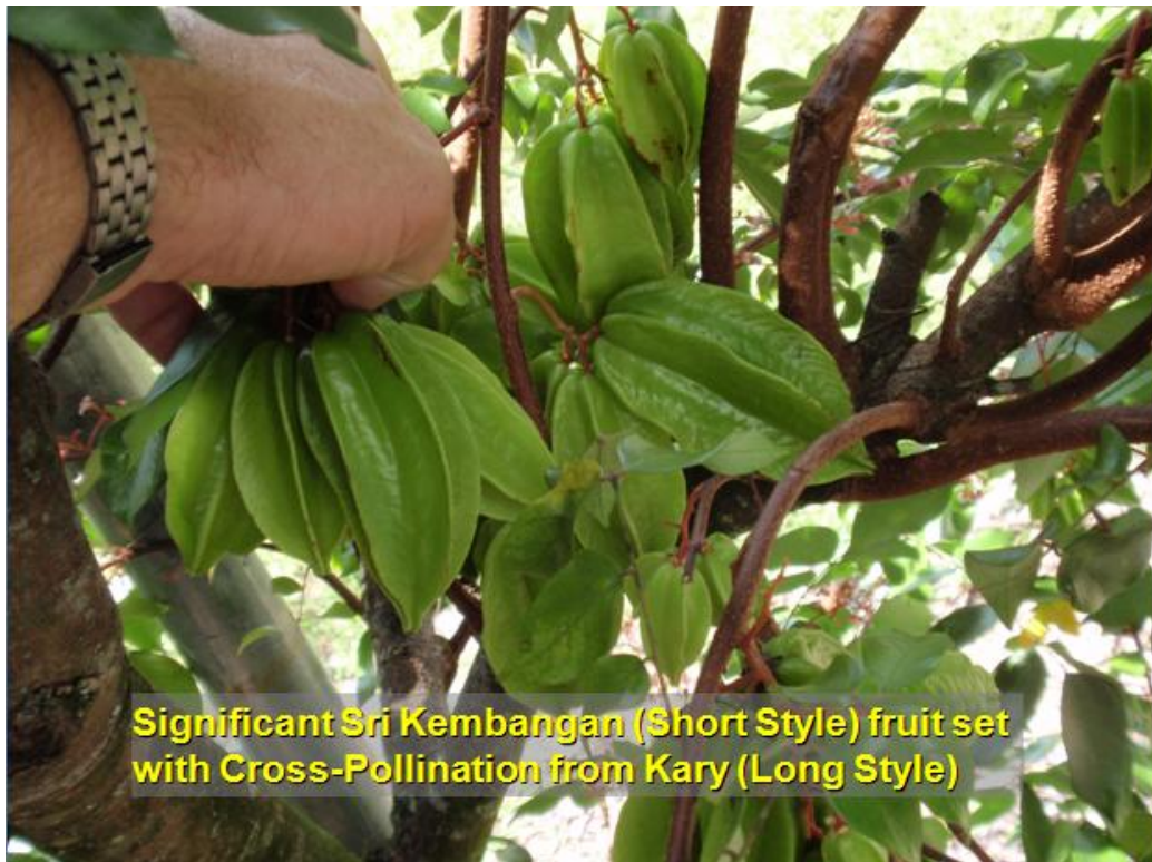
Significant Sri Kembangan (Short Style) fruit set with Cross-Pollination from Kary (Long Style)