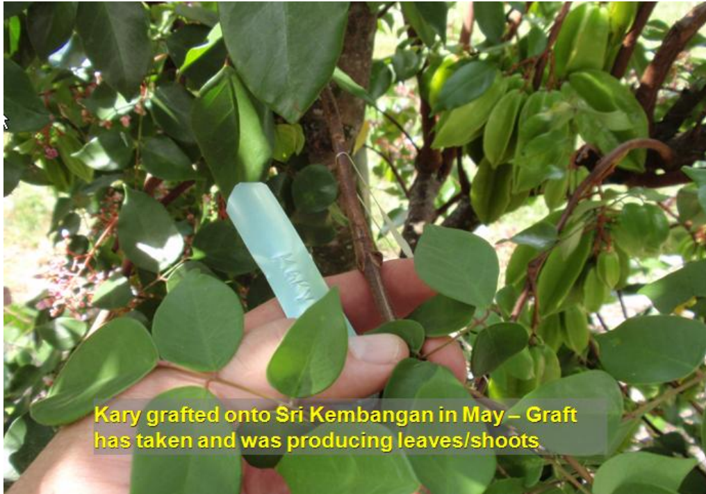
Kary grafted onto Sri Kembangan in May – Graft has taken and was producing leaves/shoots